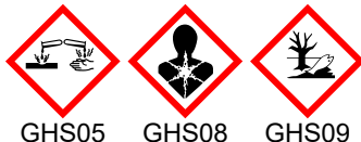
GHS05 GHS08 GHS09